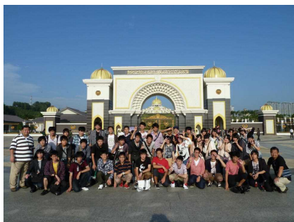
International Exchange Tour in Malaysia